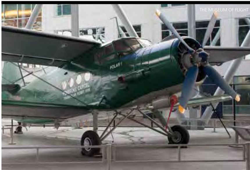
THE MUSEUM OF FLIGHT