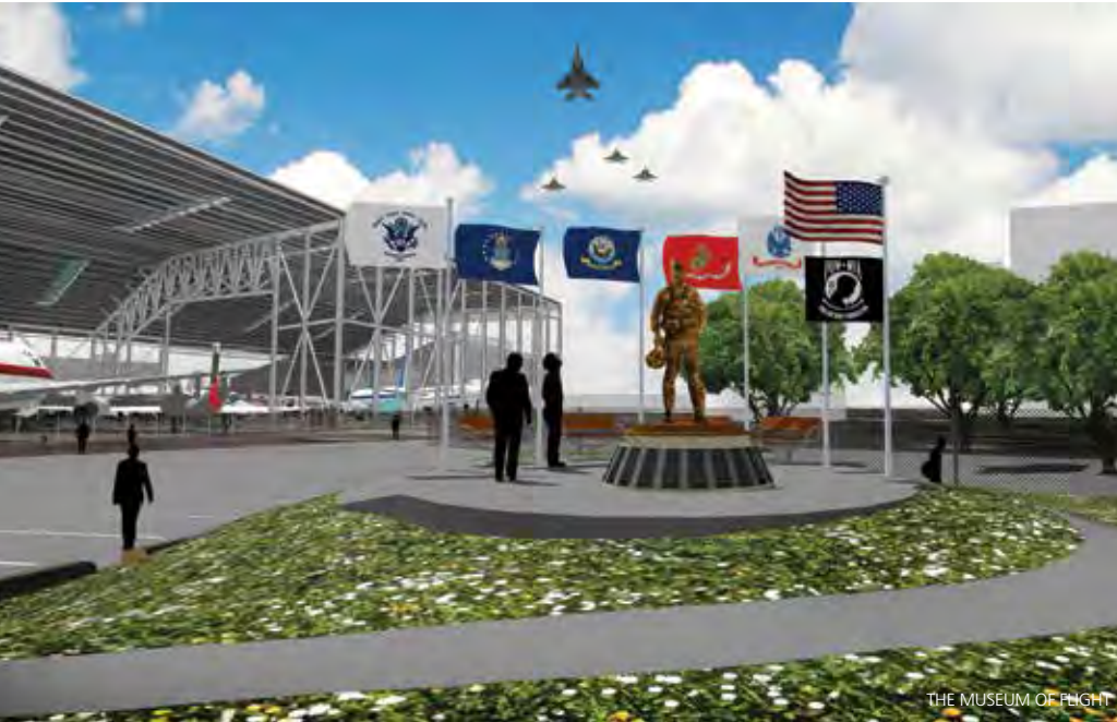
THE MUSEUM OF FLIGHT

BY: LOUISA GAYLORD, DEVELOPMENT COMMUNICATIONS COORDINATOR